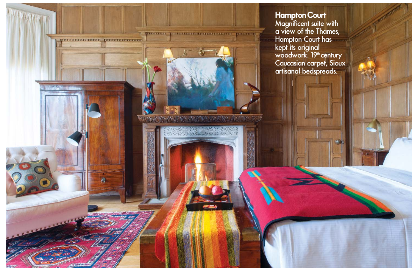
Hampton Court Magnificent suite with a view of the Thames, Hampton Court has kept its original woodwork. 19 th century Caucasian carpet, Sioux artisanal bedspreads.