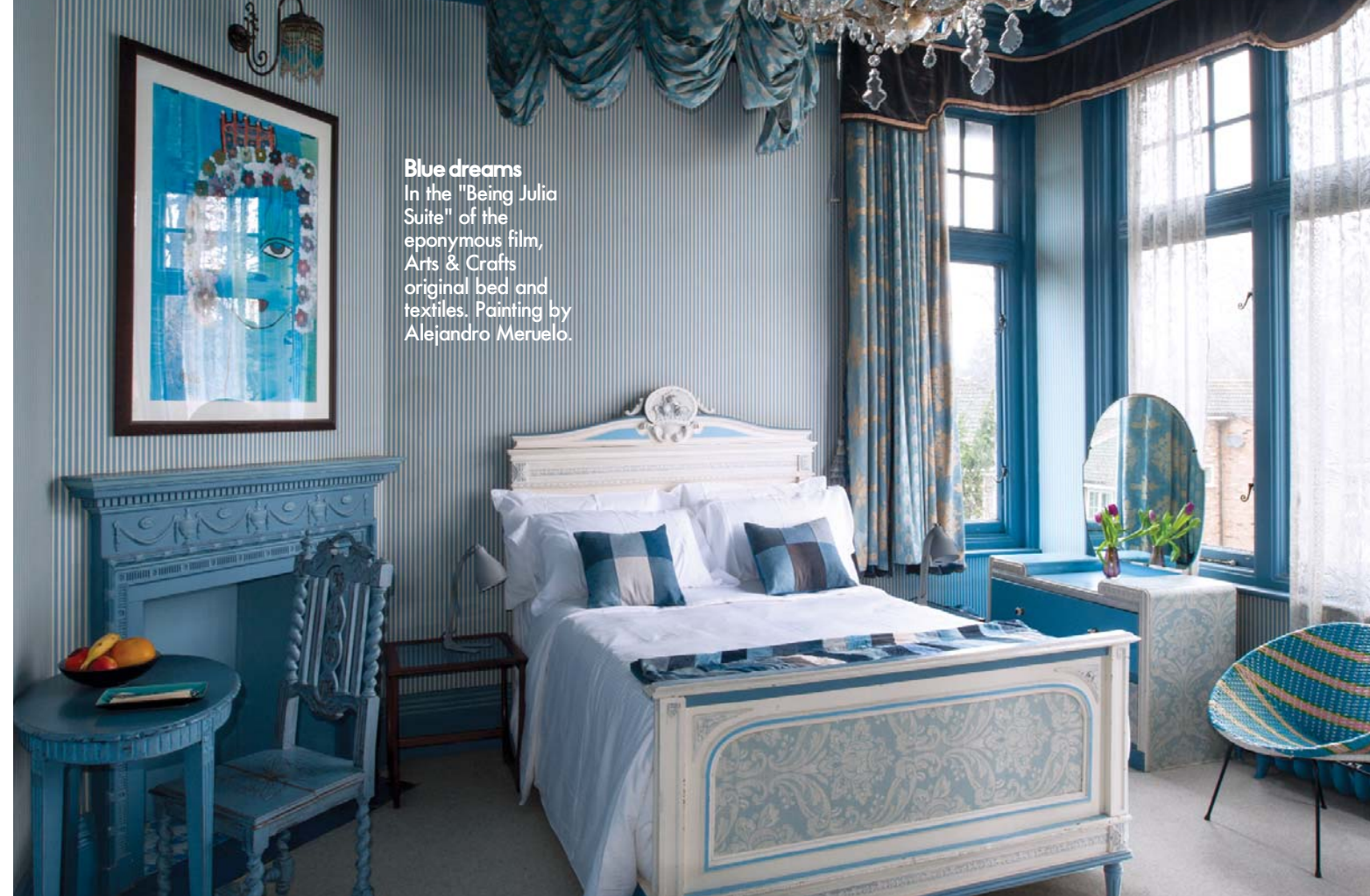
Blue dreams In the "Being Julia Suite" of the eponymous film, Arts & Crafts original bed and textiles. Painting by Alejandro Meruelo.

Oldfield, Guards Club Road, Maidenhead. www.riverartsclub.com