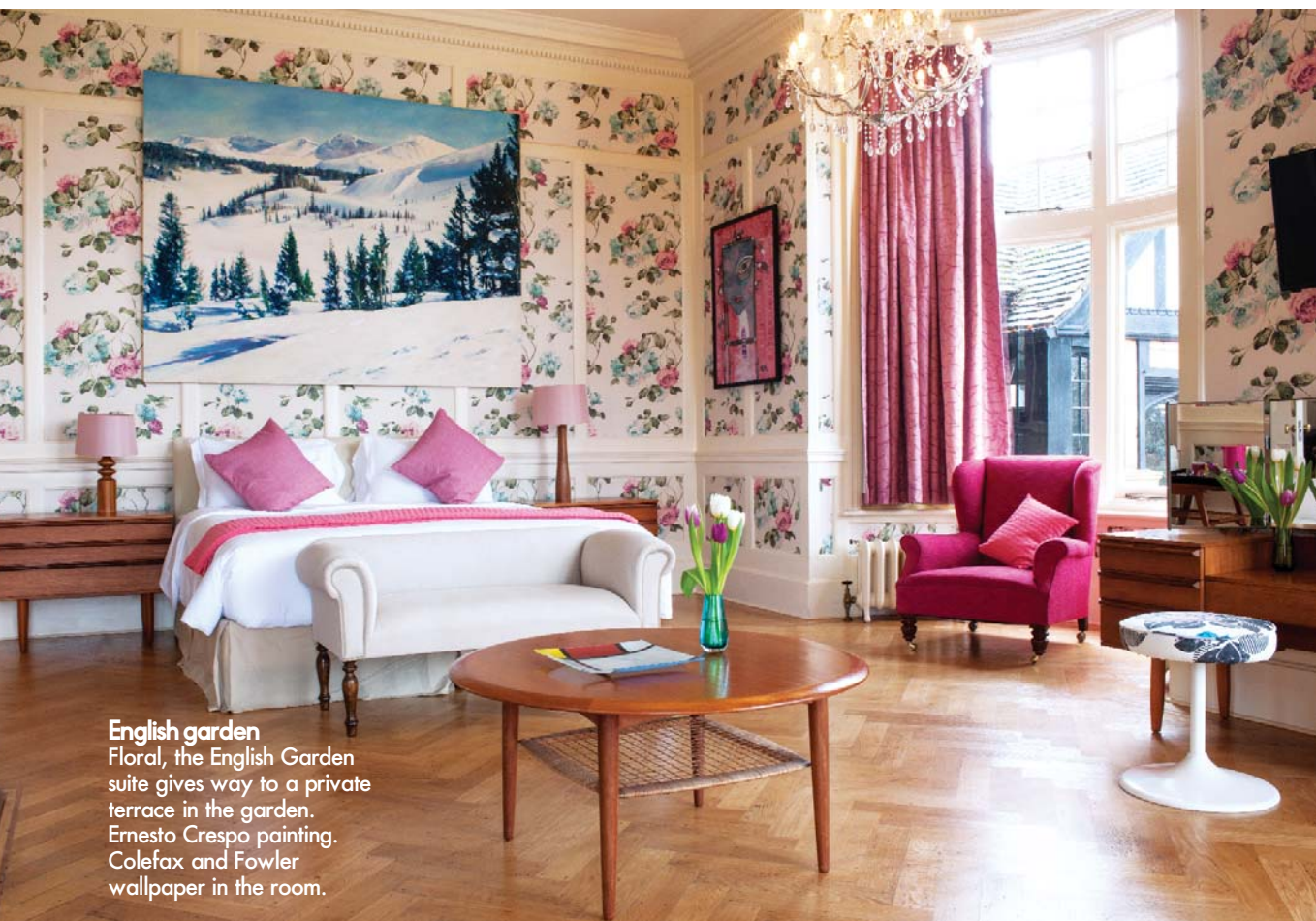
English garden Floral, the English Garden suite gives way to a private terrace in the garden. Ernesto Crespo painting. Colefax and Fowler wallpaper in the room.